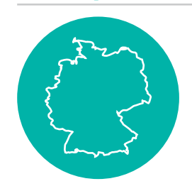
Office location: Wiesbaden, Germany Impact: