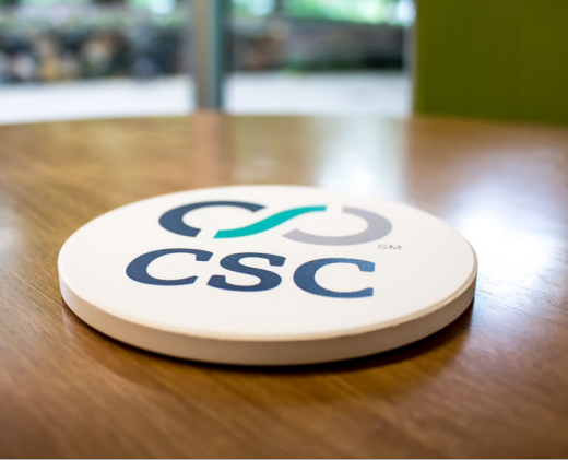
A sampling of the new materials in the headquarters - wooden tables, stone coasters, and varying floor tiles mix to create a first class building that's aesthetically appealing.